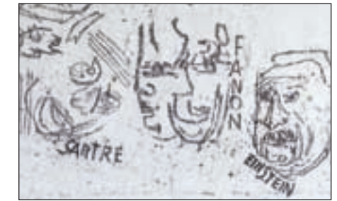
→ Östermalmstorg – Siri Derkert 1965. (see page 13)