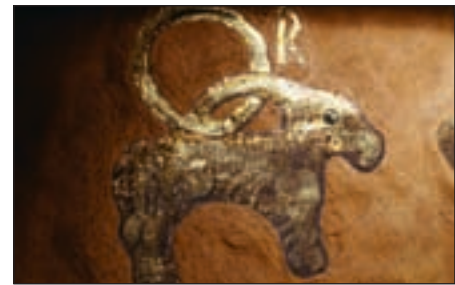
→ Rinkeby – Nisse Zetterberg 1975. (see page 20)