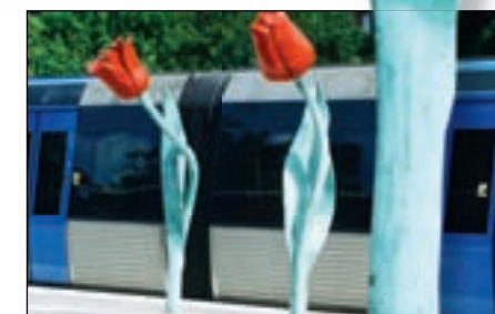
→ Högdalen – Birgitta Muhr 2002. (see page 31)