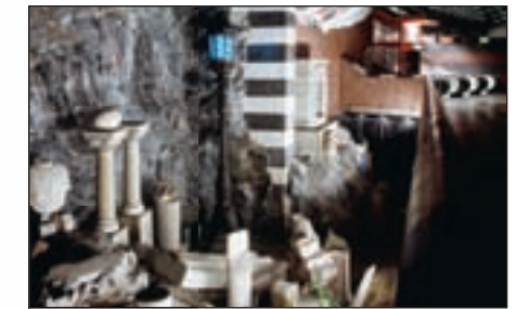
→ Kungsträdgården – Ulrik Samuelson 1977, addition 1987. (see pages 18–19)