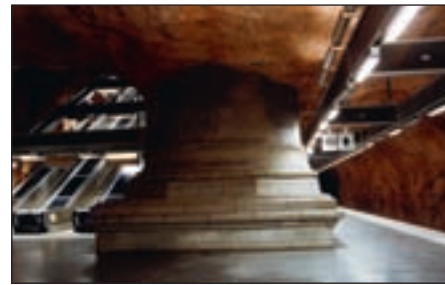
→ Rådhuset – Sigvard Olsson 1975. (see page 17)