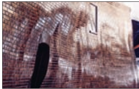
→ Sundbybergs centrum – Lars Kleen 1985. (see page 25)

The art at Rådhuset station, one of the Stockholm Metro's unique cave-like stations, illustrates different epochs in the history of Kungsholmen in a style all of its own.